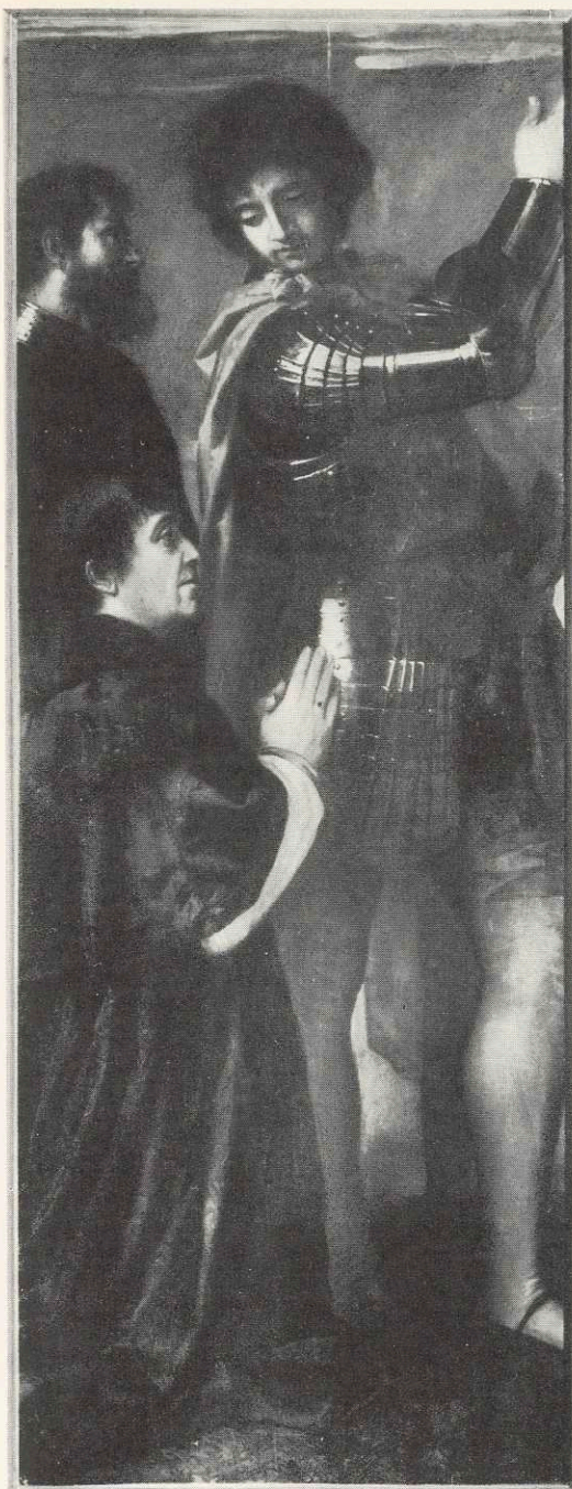
Abb. 95 Kat. 730